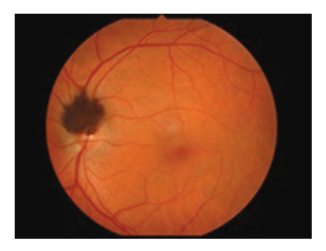
Figure 1. Color photograph shows melanocytoma of the left optic disk.

A 49 years old male patient admitted to hospital with difficulty in reading. Distant visual acuity, anterior segment examination, and intraocular pressure measurements were normal in his both eyes. The fundus examination was normal in his right eve but in the left eye a pigmented lesion overlying and surrounding the optic disk was detected (Figure 1). Visual field examination was unremarkable in his right eve but an enlarged blind spot was detected in his left eye. OCT scans (Optopol Technology S.A Ver. 2.01) showed high reflectance layer with optical shadowing behind it on the optic disk area. The high reflectance band produced by the melanocytoma was continuous with the high reflectance signal produced by the adjacent retinal nerve fiber layer (Figure 2). Horizontal diameter was 880 microns and the thickness was 4126 microns in OCT section measured at the highest point of the mass (Figure 2). There was no subretinal fluid or increase in macular thickness. The patient was advised periodic ocular examination. Regular follow-up revealed no change in OCT findings of the lesion, and his visual acuity remained 20/20.